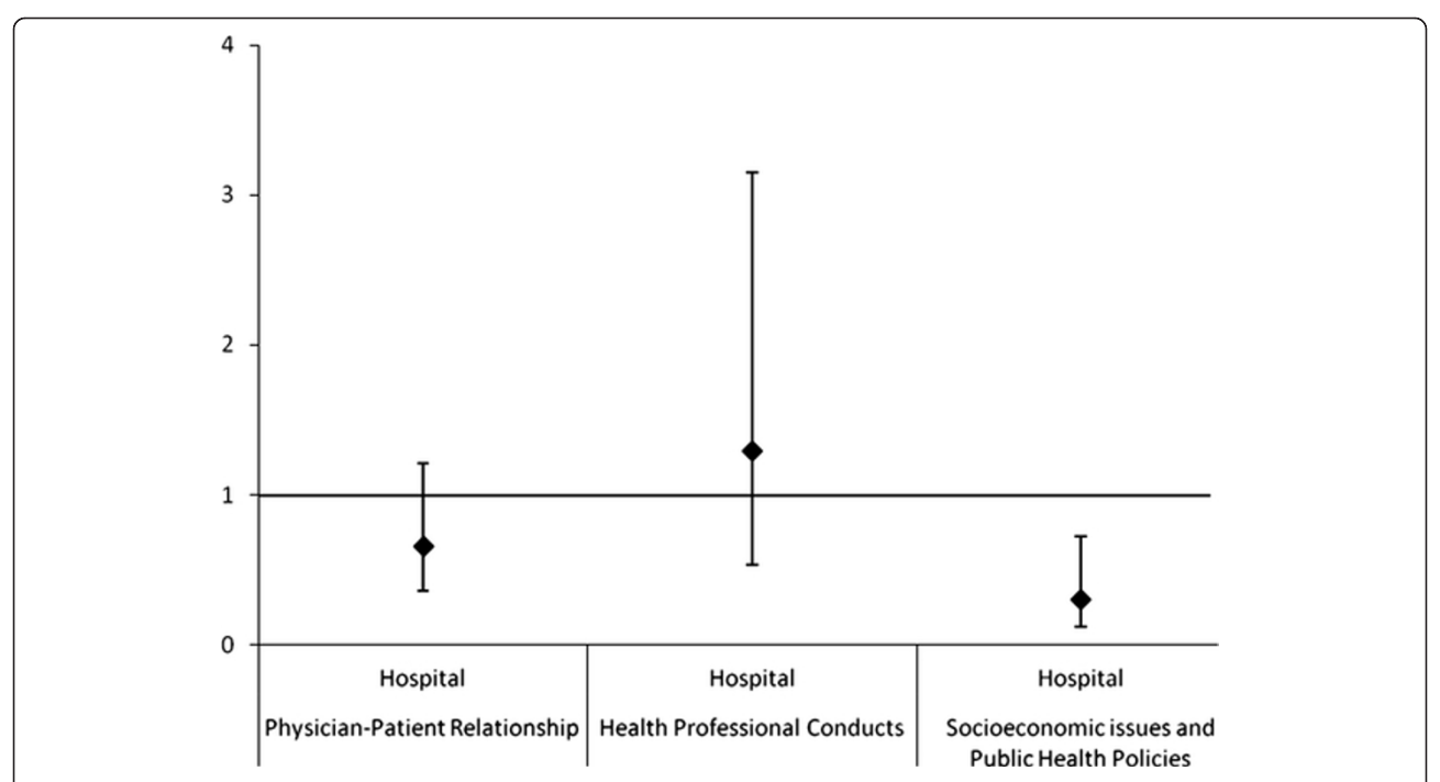
Figure 1 Prevalence Ratio: work in hospitals compared to work in the Basic Health Units (exposure) and presence of at least one report in the category of ethical problem (outcome). Note: Two outcomes were omitted: End of Life Care (not reported by family physicians) and Pediatric Education Process (CI very broad).